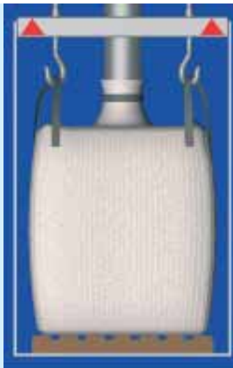
Big bag filling with overhead scales