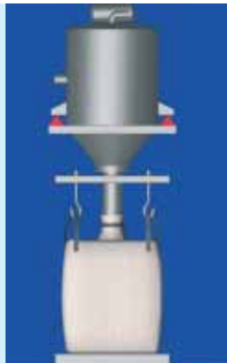
Big bag filling with weighing in advance allows very high throughput capacities