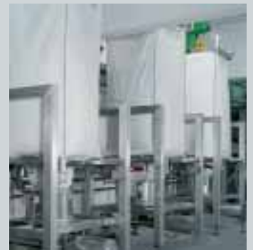
AZO also offers efficient solutions for discharging big bags.

AZO GmbH + Co. KG D-74706 Osterburken Tel. +49 6291 92-0 Fax +49 6291 92-9500 info@azo.de, www.azo.de