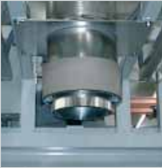
Inflatable collar deflated

Identification methods, such as barcodes and RFID ensure that the filled big bags are clearly identified and provide full documentation for subsequent processing.