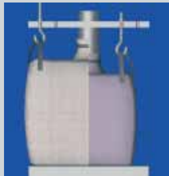
Hanging loops allow big bags in different sizes to be accommodated.

ranging from simple hooks to pneumatically controlled loop holders: All AZO mounting systems can be adjusted vertically and horizontally and can be adapted to all common big bag sizes.