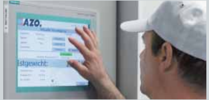
Operating terminal with touch screen