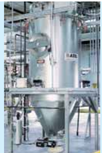
The upstream scales allow big bags to be weighed and changed in parallel, thus saving time