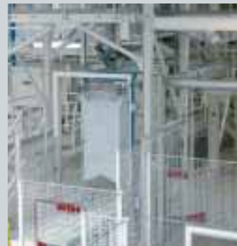
Automatic big bag filling system