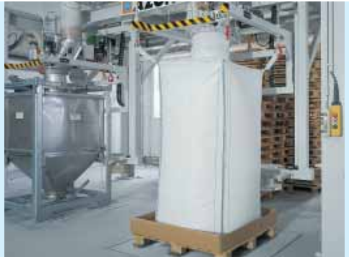
Filling PVC dryblend: The big bag with pallet stands on a floor scale, dosing screws take care of dosing