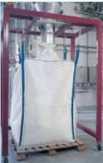
Pneumatic filling without weighing

As a reliable partner for raw material and process automation, we offer a range of solutions for filling big bags. These solutions are distinguished by their high level of reliability and operator-friendliness.