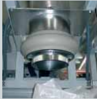
Inflatable collar inflated