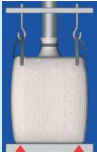
Big bag filling with floor scales