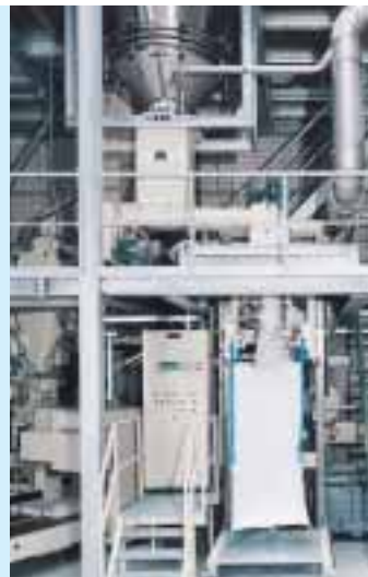
Automatic filling systems with hanging scales